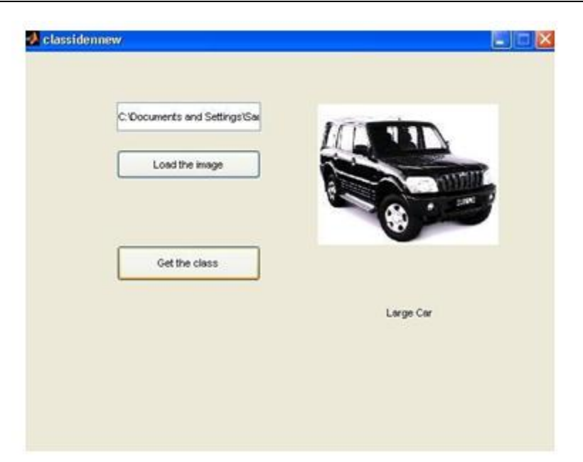
Automated System for Detection of Vehicle Features