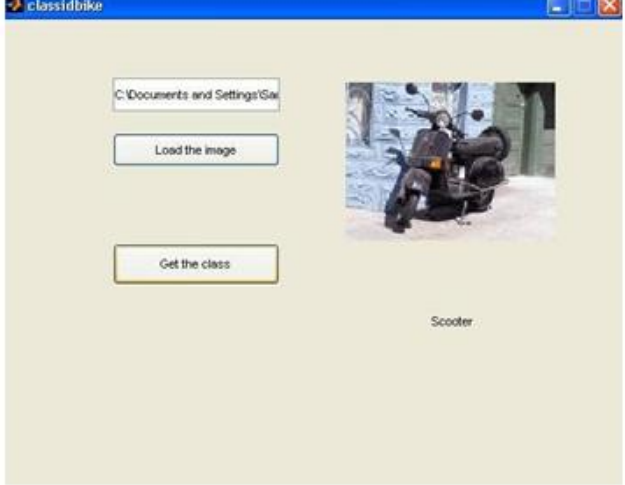
Fig 2.3: GUI for two wheeler identification